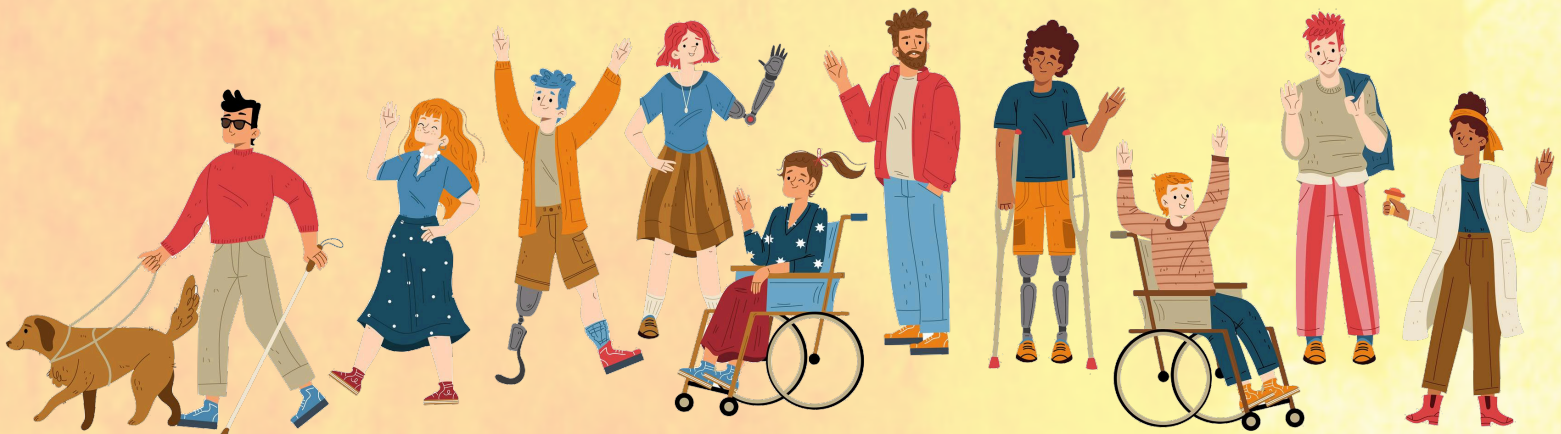
Picture Description: A Diverse group of 10 people with and without visible disabilities waving